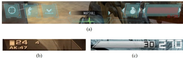
Figure 1. Example HUD displays. (a) Call of Duty: Strike Team , depicting controls (soft buttons, left-side), health (variation of bar), and ammunition as a number and bar; (b) Tom Clancy's Rainbow Six: Vegas , depicting ammunition numerically; (c) Call of Duty: Ghosts depicting ammunition both numerically and as a bar/meter.

First-person shooter (FPS) games task players with completing missions while shooting enemies from a first-person viewpoint. This is a popular and profitable game genre [1]. They are interesting platforms for empirical research, as numerous design considerations go into developing the UI for such a game. Our work investigates methods of displaying status information to the player in FPS games. Broadly speaking, two classes of information displays are prevalent in FPS games. The first is heads-up displays, (HUDs) which show game information in meters, bars, on-screen icons, or numeric displays. Sample HUDs representing this range of options are shown in Figure 1.