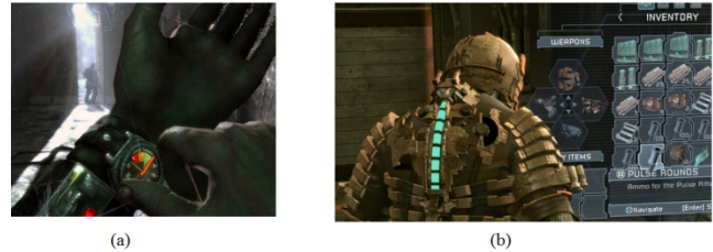
Figure 2. Diegetic game displays. (a) Metro 2033 . (b) Dead Space displays the health meter (blue bar mounted on player's back) diegetically. The in-game inventory is also presented like an augmented reality/holographic display floating in front of the player.

Our research investigates the most effective means of presenting information to FPS players. To address this question, we conducted an experiment comparing several diegetic and HUD options for displaying ammunition information. We chose to study this in the context of ammunition, as it is a critical display in FPS games [2]. Future studies will look at similar options for other information displays (e.g., health).