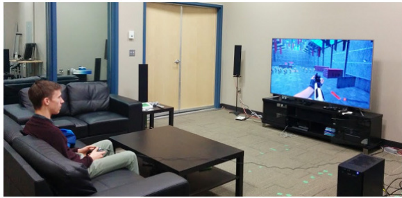
Figure 3. Participant performing the study. The game can be seen on the display.