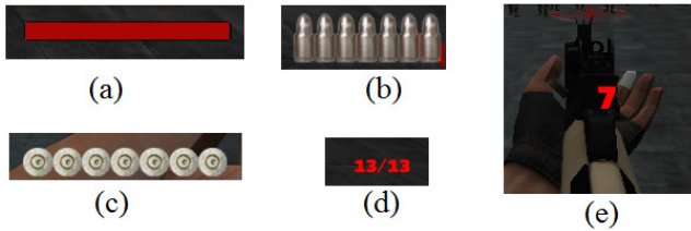
Figure 4. The displays studied. (a) Bar, (b) Icon Bar, (c) Icon in Game, (d) Number on HUD, (e) Number in Game. Bar, Icon Bar, and Number on HUD appeared at the bottom right corner of the screen, fixed in the game HUD. Icon in Game and Number in Game were diegetic options that appeared co-located with the player's gun (and were thus subject to player rotation/viewpoint control).

Enemies started in a semi-circle around the participant, and slowly advanced inward. The participant was unable to move, but could rotate the viewpoint in typical FPS fashion.