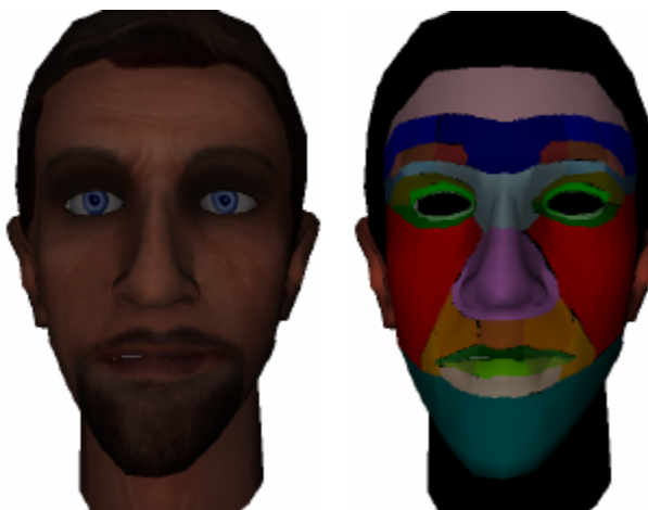
Figure 2. Face SubRegions. These are small areas that usually move together and are controlled by FeaturePoints. iFACE Regions are related groups of these SubRegions, e.g. eye area.

In this paper, we report on FMO implementation within our proposed framework called iFACE (Interactive Face Animation – Comprehensive Environment). iFACE is based on a hierarchical parameterized head model that can effectively control the face geometry (2D or 3D), and behavioural extensions in form of Knowledge, Mood, and Personality spaces (see Figure 3 ). iFACE provides an XML-based scripting language, object model and API (Application Programming Interface), and an authoring/design tool (iFaceStudio). The framework is used within the context of SAGE (Simulation and Advanced Gaming Environment) project of Simon Fraser University to create a "game-like" online learning tool for medical students (see Figure 1 ). SAGE utilizes iFACE to replace live-action patient footage and real instructors with Social Conversational Agents (SCAs).