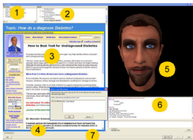
Figure 5: Screenshot of COMPS User Interface with a Simulated Patient