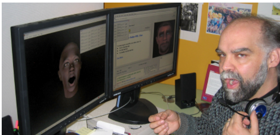
Figure 1: Instructor remotely delivering web based collaborative content in COMPS while controlling the expressive iFACE face agent via speaking through his computer microphone in real-time.

Abstract: The use of Problem-Based Learning (PBL) in medical education and other educational settings has escalated. PBL's strength in learning is mostly due to its collaborative and open-ended problem solving approach. Traditional PBL was designed to be used in live team environments rather than in an online setting. We describe research that allows for web-based PBL via geographically distributed physical locations that emphasize PBL's collaboration and open brainstorming approach using interactive web, gaming and simulation techniques. We describe Interactive Face Animation - Comprehensive Environment (iFACE) which allows for expressive voice based character agents along with Collaborative Online Multimedia Problem-based Simulation Software (COMPS) which integrates iFace within a customizable web-based collaboration system. COMPS creates an XML-based multimedia communication medium that is effective for group based case presentations, discussions and other PBL activities. We also discuss our medical school prototype that allows for brainstorming sessions, remote instructors and simulated patients.